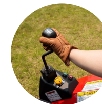
6. Front-end loader joystick lever