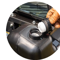
5. High-capacity fuel tank