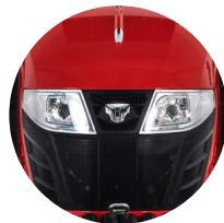
1. Hood design

High performance meets efficiency in this highly customizable Series 3 tractor that has the power to support your productivity.