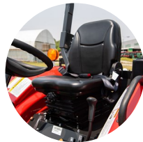
2. Comfortable suspension seat