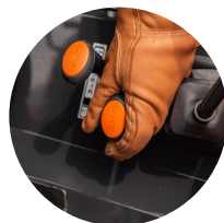
3. Ergonomic lever