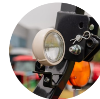
4. Rear work light