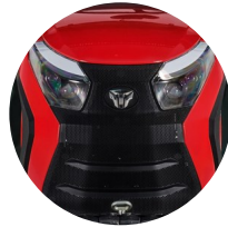
1. New iconic hood

Compact enough to give you the versatility you need, and powerful enough to take on the tougher jobs on and off the field.