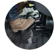
4. Highly responsive forward & reverse HST (F50CHN)