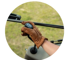
6. Front-end loader joystick lever