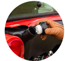
5. High-capacity fuel tank