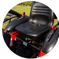
2. Comfortable suspension seat