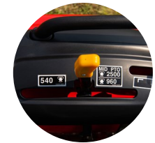
5. PTO lever