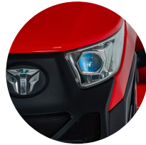
1. New iconic hood

A versatile and highly maneuverable sub-compact tractor perfect for hobbyists to groundskeepers. Enjoy the size of a ride-on mower with the capabilities of a full-size tractor.