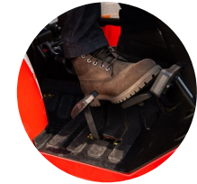
4. Highly responsive forward & reverse HST (2500HL)