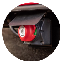
2. Battery shut-off switch