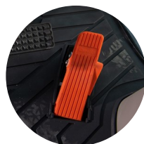
3. Electronic organ-type pedal