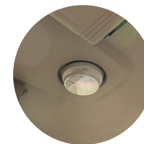
4. LED interior lighting