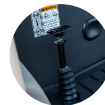
5. Differential lock system