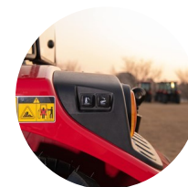
6. External hitch control buttons