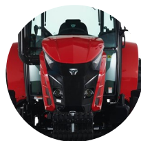
1. Tiger face front fascia

The T78 is the result of TYM's decades-long experience and the embodiment of TYM's philosophy on technology, design, and agriculture.