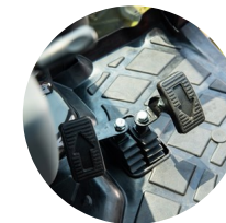
4. Highly responsive forward & reverse HST (6225CH)