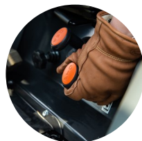
3. Ergonomic lever