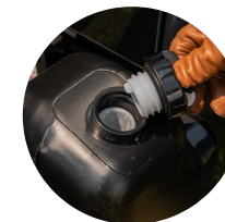
5. High-capacity fuel tank