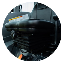
2. Comfortable suspension seat