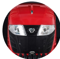
1. Hood design

High performance meets efficiency in this highly customizable Series 3 tractor that has the power to support your productivity.