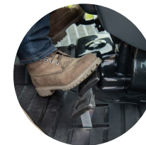
4. Highly responsive forward & reverse HST (F36CHN)