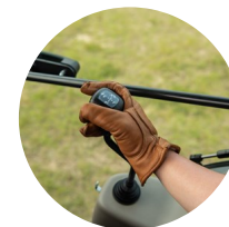
6. Front-end loader joystick lever