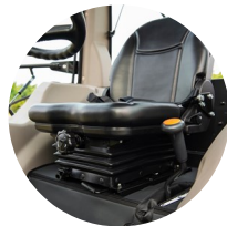
2. Comfortable suspension seat