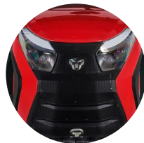
1. New iconic hood

Compact enough to give you the versatility you need, and powerful enough to take on the tougher jobs on and off the field.