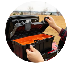
6. Wide loadspace with a well-equipped toolbox