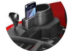
5. Wireless smartphone charger