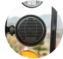
4. Bluetooth speaker with IP66 grade waterproofing