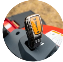
1. 2 range hydrostatic transmission (HST)

Get work done quicker with this small-frame tractor. Highly maneuverable and with maximized lift capabilities, the T25 is designed to be an all-round multi-tasking machine.