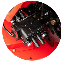
2. 3rd function for 4-in-1 bucket work (optional)