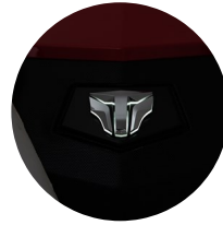
1. Backlit logo

TYM's flagship tractor combines sophisticated design, powerful performance, and premium features for operator convenience.