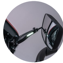
2. LED Dual side mirrors