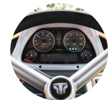
6. Digital instrument panel