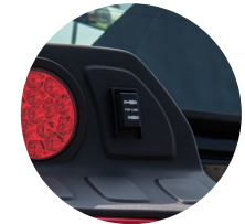
5. External hydraulic top link switch