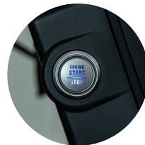
3. Push to start button